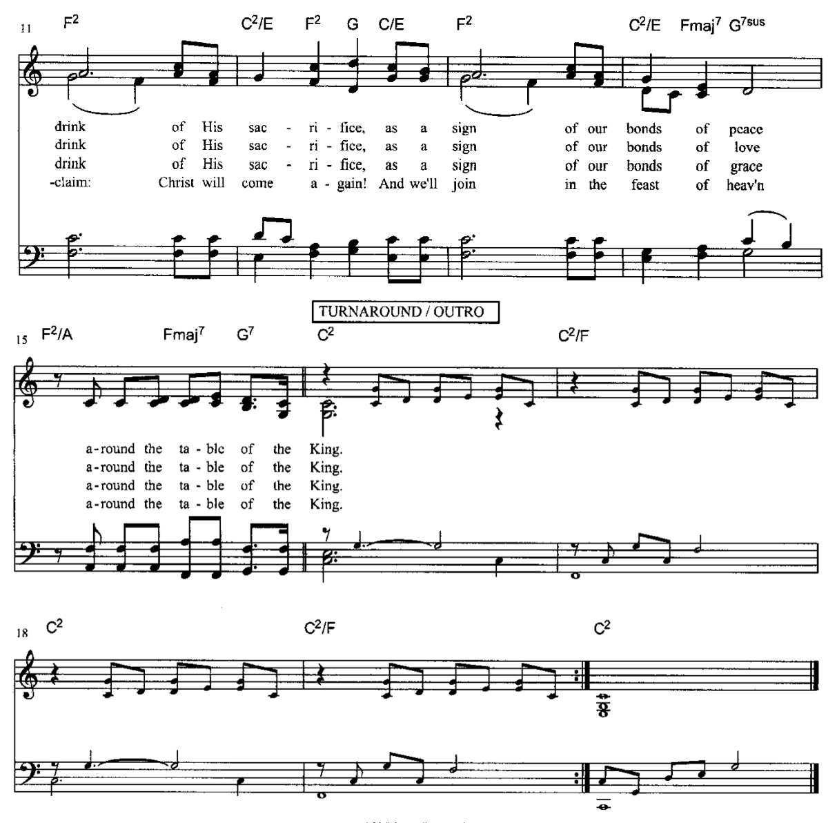
CCLI Song # 5003372 © 2007 Thankyou Music For use solely with the SongSelect® Terms of Use. All rights reserved, www.ccli.com CCLI License # 11267187